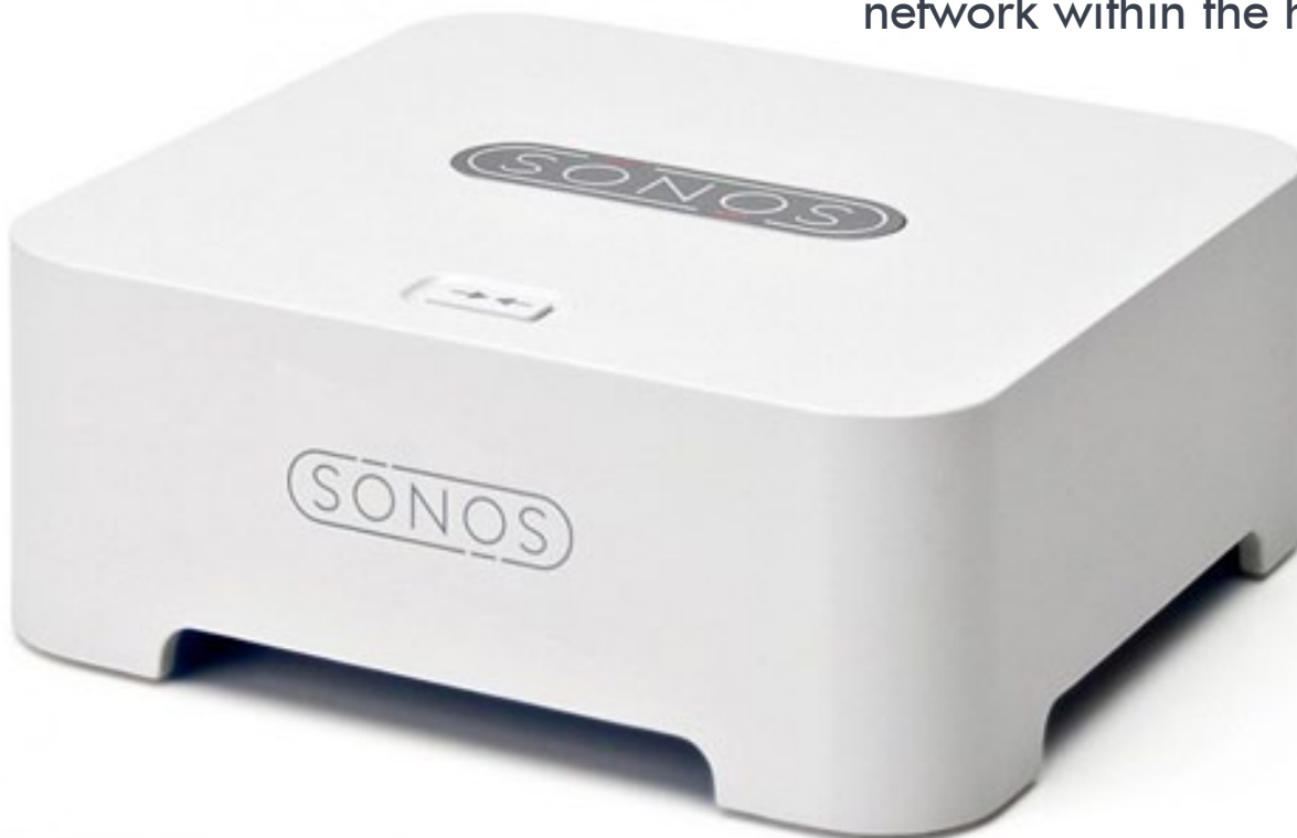
SONOS BRIDGE $49

The BRIDGE allows you to place the PLAY Series in a location that does not have a router or ethernet cable. The system is based on a wireless mesh network. The PLAY products and CONNECTs are mesh "nodes." The products communicate across this network, through the separate nodes. By adding the BRIDGE and each PLAY product, you are extending your network within the home.